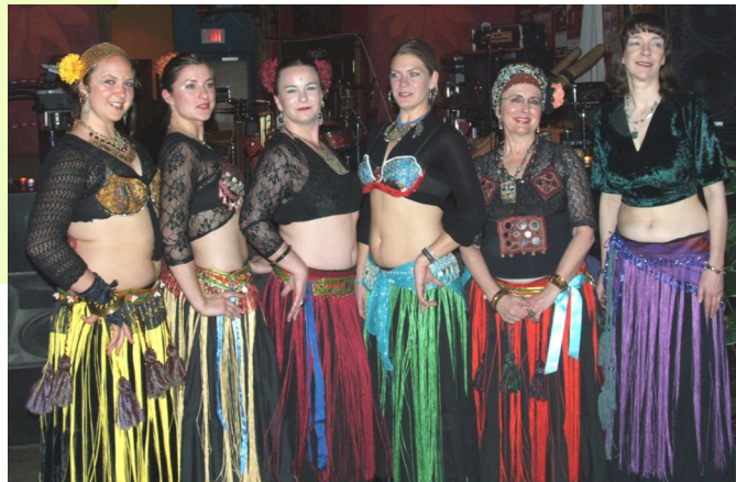
HDBG members at the first Showcase