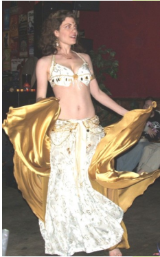
Dancing at the quarterly HDBG Showcase

Established in 2005, the High Desert Bellydance Guild supports Central Oregon's bellydance community. The Mission of the Guild is threefold: